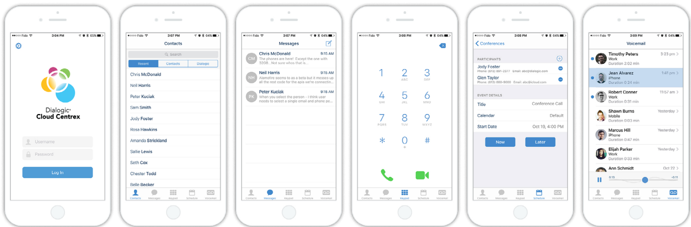
Figure 1 – Dialogic Cloud Centrex mobile application provides seamless feature access

Dialogic CC mobile application for Android and iOS devices supports customers' digital, mobile lifestyle. Mobile users can seamlessly transition between both fixed and mobile devices for unparalleled flexibility and increased savings on their mobile data usage. It includes features like enterprise directory access, personal contact list integration, scheduled and reservationless on-demand conferencing, messaging, and visual voice mail access all on a modern SIP-based application. Subscribers can move seamlessly between their physical phone and smartphone to make and receive audio calls and hold conferences anytime and anywhere.